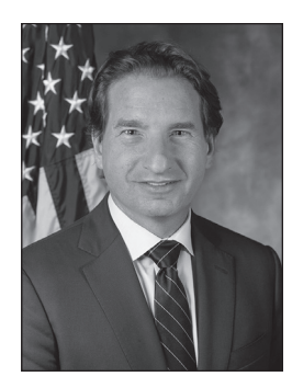
Congressional District 3